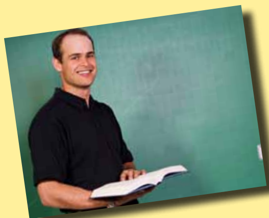
Learn AP* at TU!