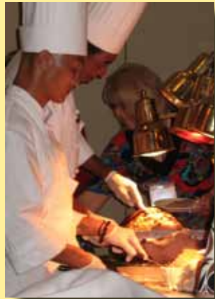
Come for the Hospitality!

THE UNIVERSITY OF TULSA'S DIVISION OF CONTINUING EDUCATION