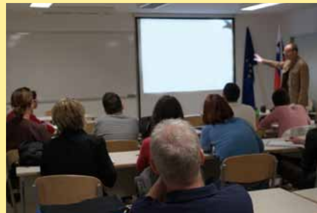
Take in the Sights!