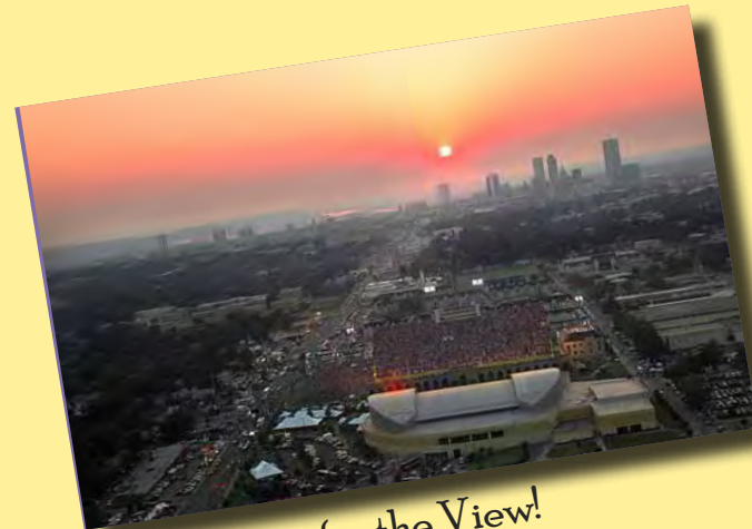
Stay for the View!